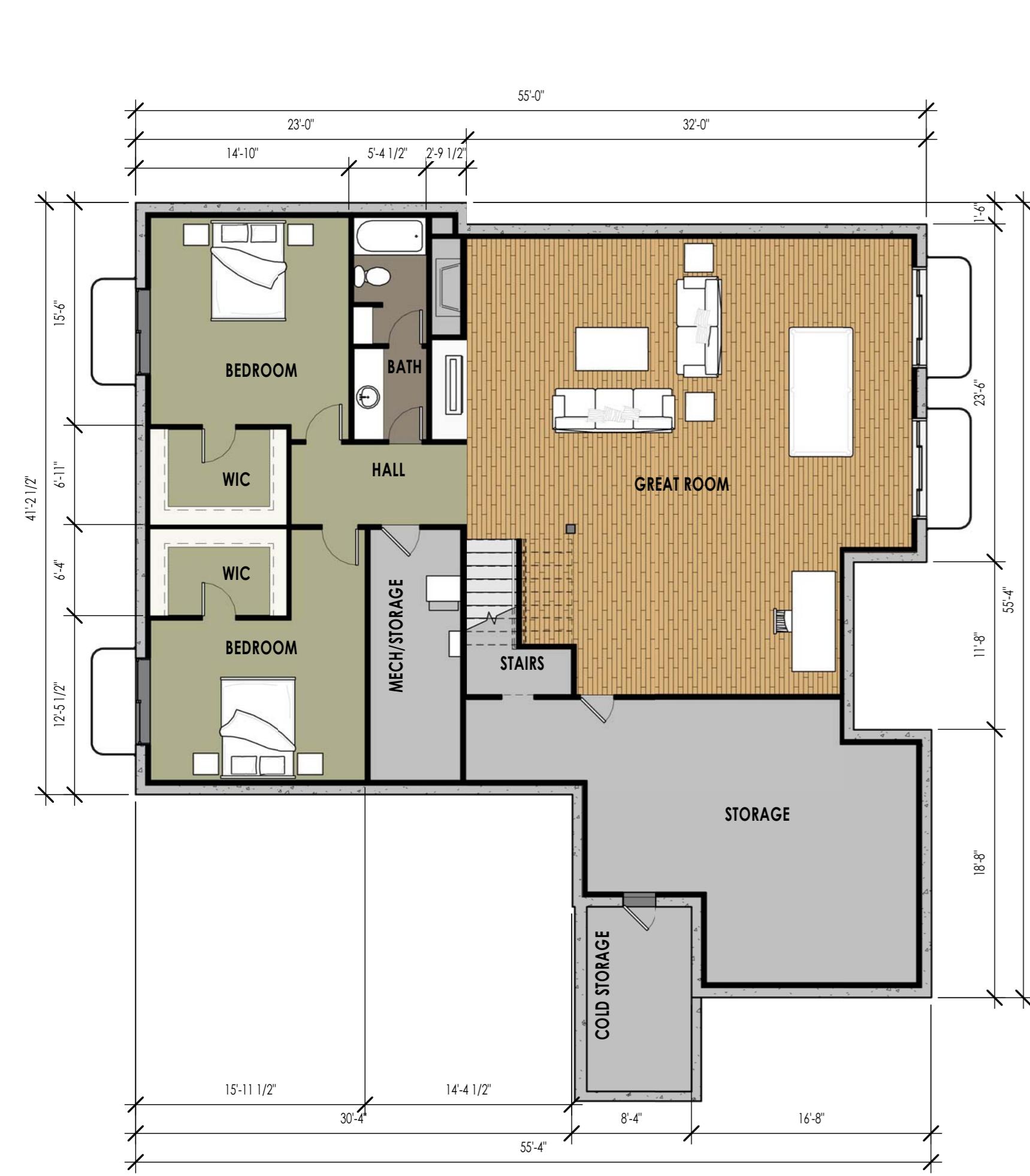
LEVEL 0 - SCHEMATIC FLOOR PLAN