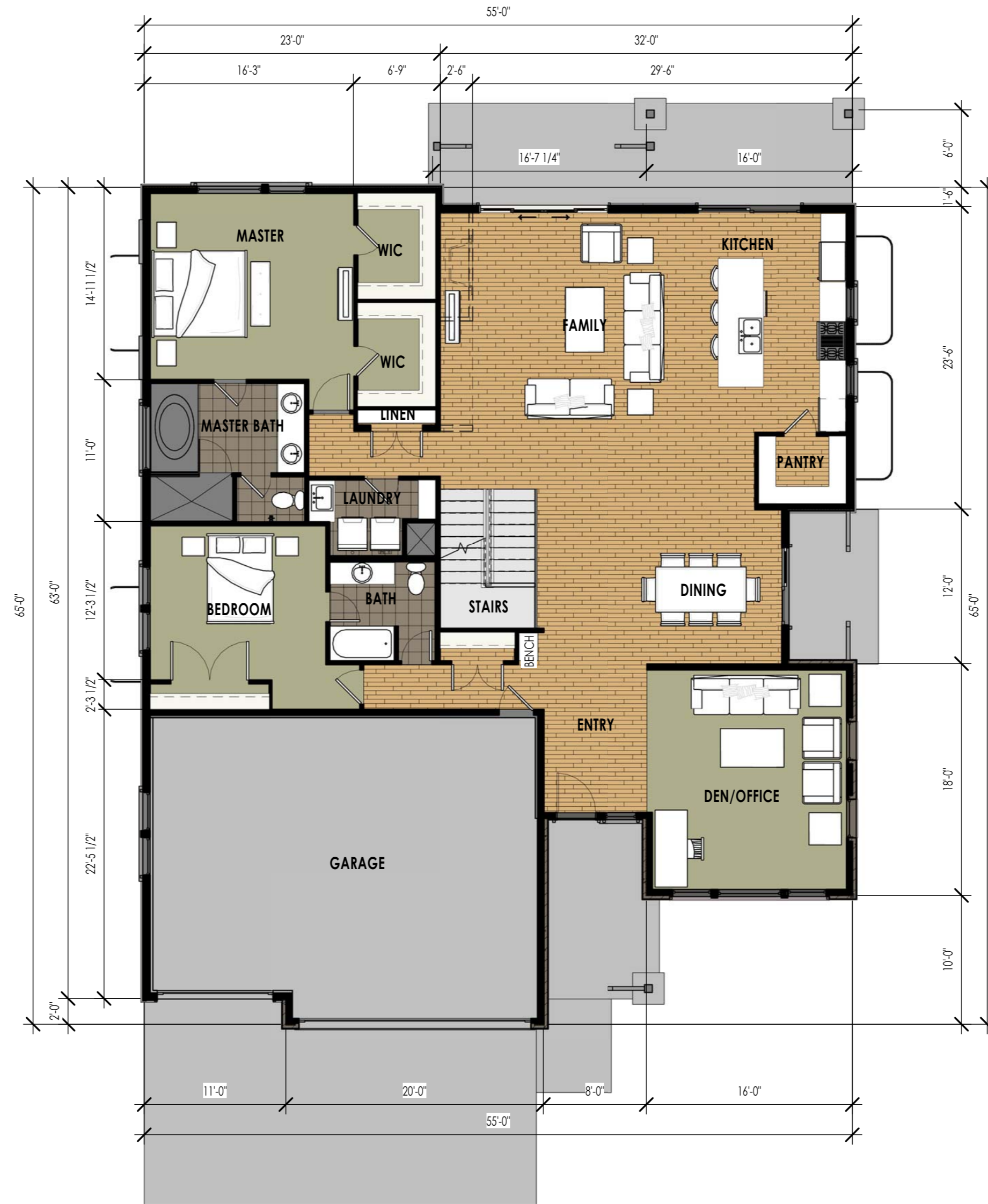
LEVEL 1 - SCHEMATIC FLOOR PLAN